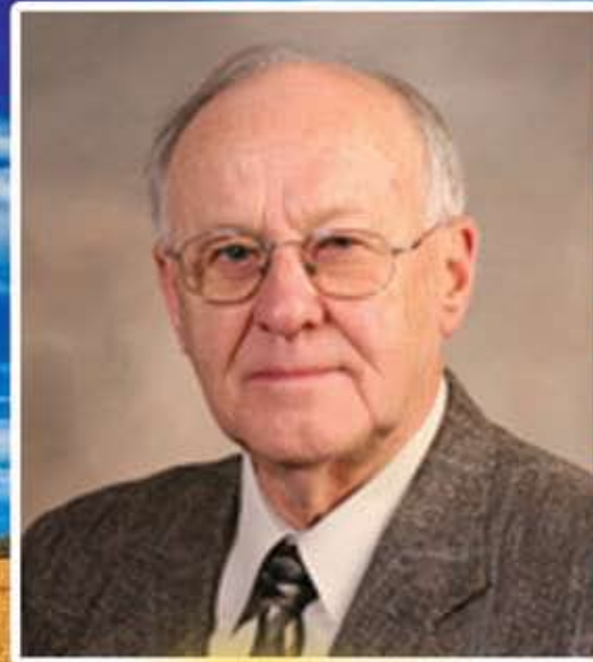
Glen FROSETH HOUSE