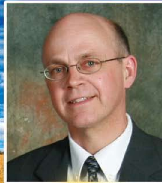
Jim BARTLETT SENATE